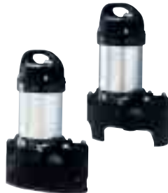
USE type submersible waste water drain pump

For draining waste water from small building φ40~φ100, 0.25kW~3.7kW