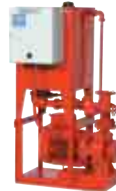
US type fire extinguishing pump unit

For indoor fire hydrant facilities (US-HA)