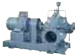
DV type both-side suction centrifugal pump For waterworks and factories φ200~φ350, 11kW~250kW