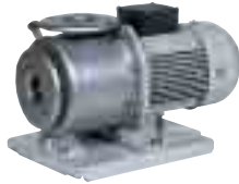
NJP type stainless multi-stage centrifugal pump Rustless pump for water supply to buildings φ40~φ80, 1.5kW~11kW