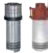
JUP type stainless submersible centrifugal pump Rustless pump for water supply to buildings φ40, φ50, 1.5kW~7.5kW