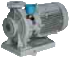
JOVD type end suction centrifugal pump For water supply in buildings and factories φ40~φ100, 1.5kW~15kW