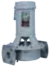
JLP type stainless inline pump Rustless pump for circulating cool and hot water φ32~φ50, 0.25kW~1.5kW