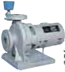
JD type mono-block pump For water supply in buildings and factories φ40~φ100, 0.25kW~11kW