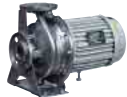
JDP type stainless monoblock pump Rustless pump for water supply to buildings and for setup of general industrial equipment φ32~φ50, 0.75kW~3.7kW